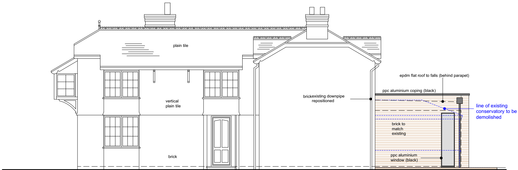
SIDE (SOUTH EAST) ELEVATION